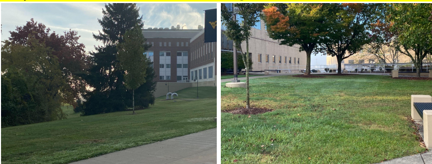
Site 1: Engineering PRT Station/ Engineering Building Front Lawns; Request: Adirondack chairs, lounge furniture similar to the E. Moore hall furniture