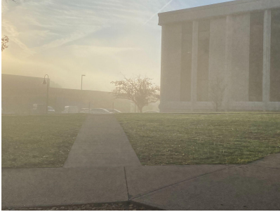
Site 5 : Evansdale Residential Complex Front/Side Lawns; Requests: Picnic Tables