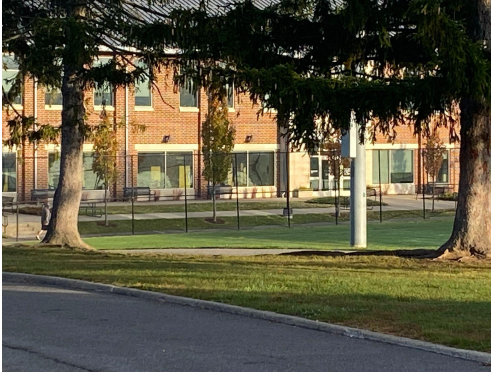
Site 5: Behind Allen Hall/Side Pocket of Towers; Request: Adirondack chairs