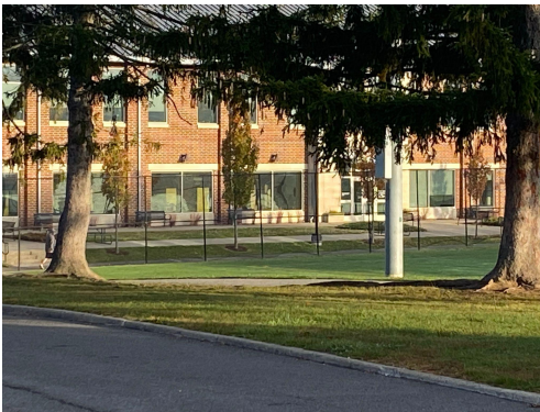
Site 5: Behind Allen Hall/Side Pocket of Towers; Request: Adirondack chairs