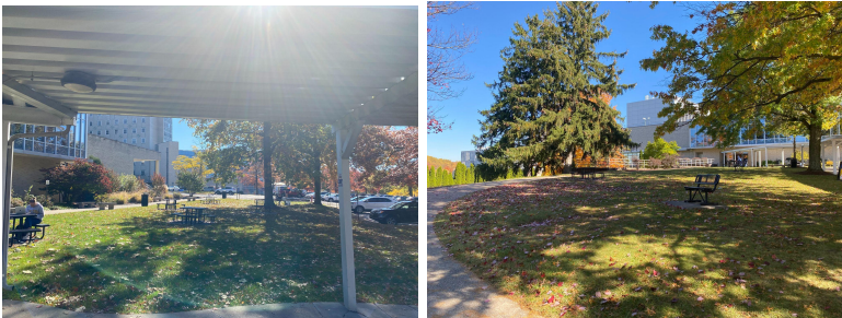
Site 1 : Pylons Front Lawns; Request: Tables with umbrella covering

Proposed Increase in Semi-Permanent Seating Options: