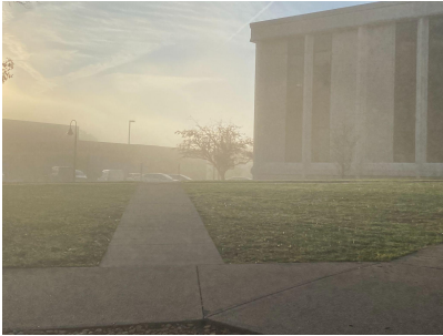
Site 5 : Evansdale Residential Complex Front/Side Lawns; Requests: Picnic Tables