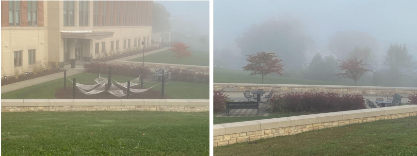
Site 4: Student Health Center/Soccer Field; Request: Adirondack chairs